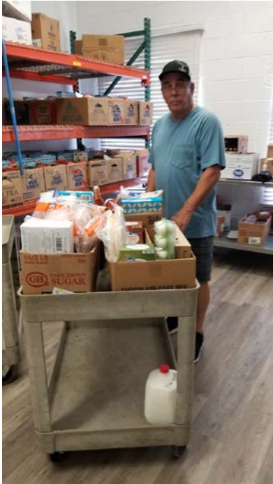
Casa Grande Food Bank

The Opportunity Tree provided services to 30 seniors with cognitive disabilities, Seeds of Hope provided services to 23 seniors and Against Abuse provided advocacy services to 73 individuals.