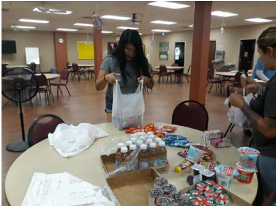
Dorothy Powell Senior Center- Senior Meals